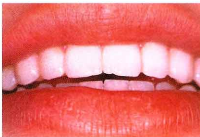
Teeth tray after.

Brighton's most experienced dentists. Both treatments were as effective as each other with improvement of up to 9 shades lighter, and these great results can last for up to 3 years if you look after your teeth