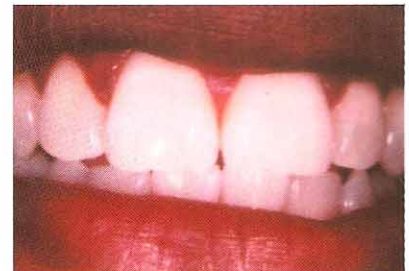
After Brite Smile.

well. Which includes not eating or drinking staining foods and beverages (ie coffee, red wine etc), and keeping off the cigarettes.